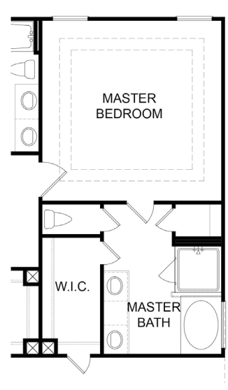
Alternate Master Bath Layout