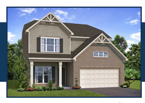
3 Bedrooms 2.5 Bathrooms